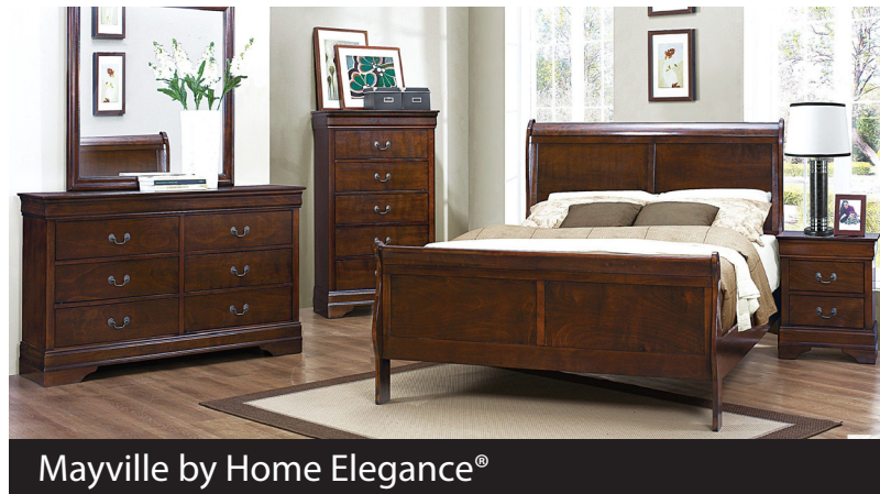
Mayville by Home Elegance®