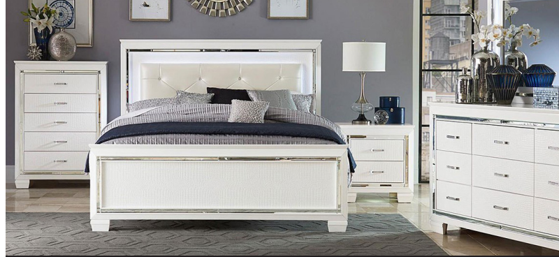
Allura by Home Elegance®