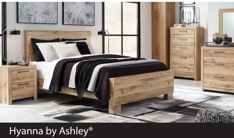
Hyanna by Ashley®