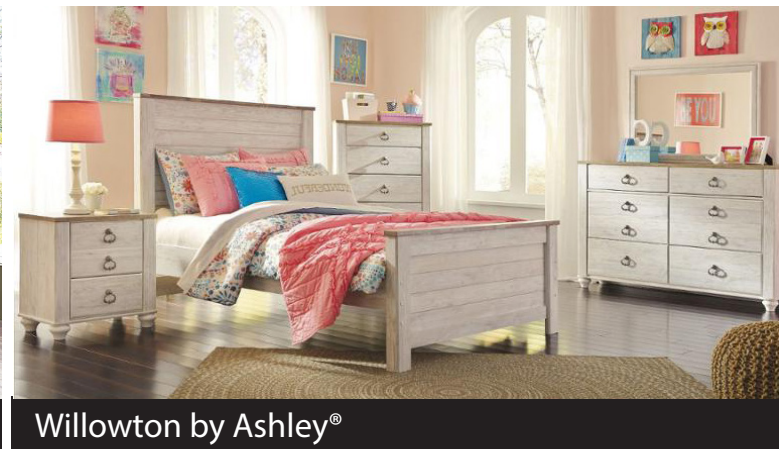
Willowton by Ashley®