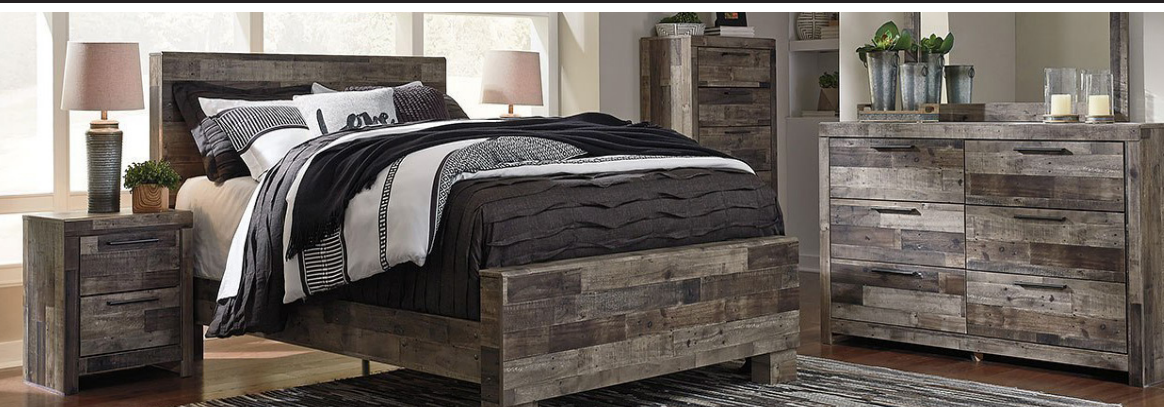
Derekson by Ashley®

SEALY® STONELEIGH (FIRM OR PLUSH) | SEALY® MEDINA HYBRID | SOLSTICE SLEEP® WILMINGTON PILLOW TOP