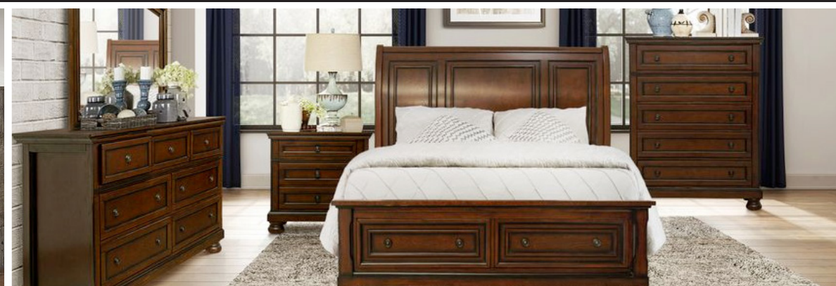
Begonia by Home Elegance®

$100 OFF ANY TWIN - FULL - QUEEN - KING BED