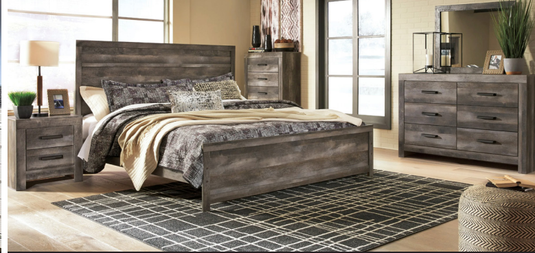
Wynnlow by Ashley®