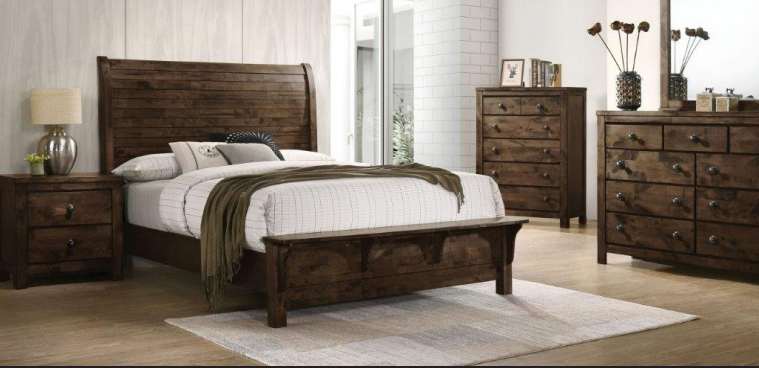
Ashton Hills by Emerald Home®